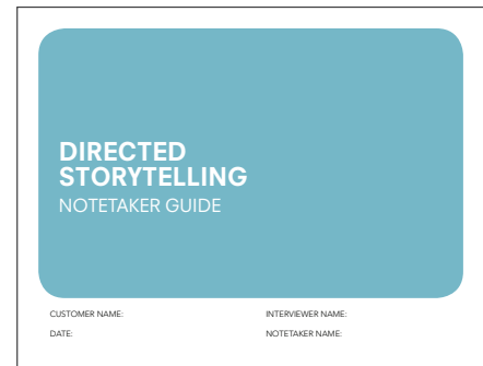
Directed Storytelling Notetaker Guide