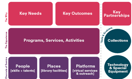
A Diagram Showing the Components of The Library Experience which can be Identified Through Directed Storytelling Interviews