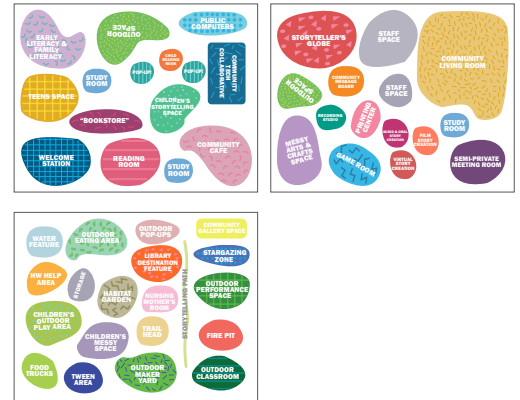
Magnets that identify emerging space types heard through the process.