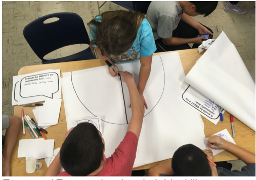
Teens and Tweens drawing their ideal library.