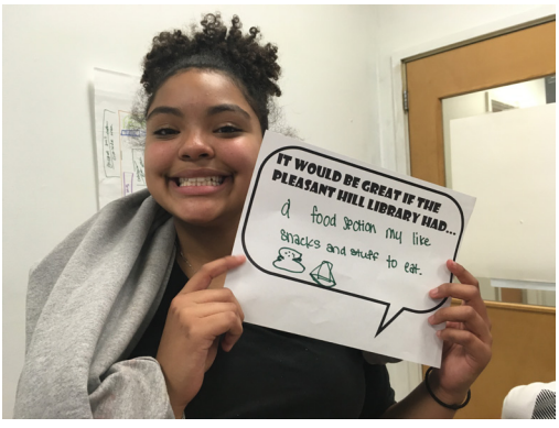
Teen holding up her "Selfie Sign" describing that she wants a food station at the library.