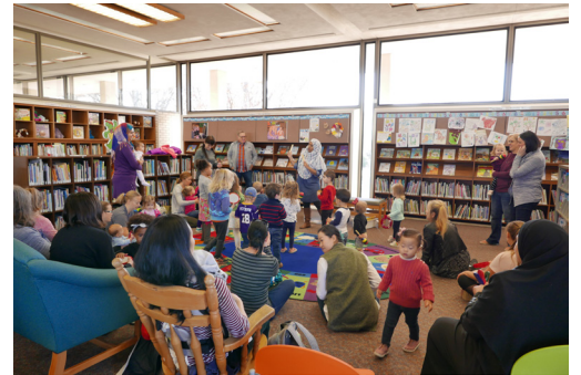
Example of analysis after observing a program.