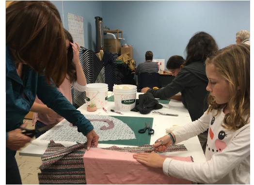
Kids at the library participating in a program called Eco Studio at the Pleasant Hill Library in California.