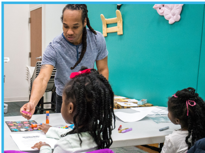
African American Inventors program at the Spauldings Branch.