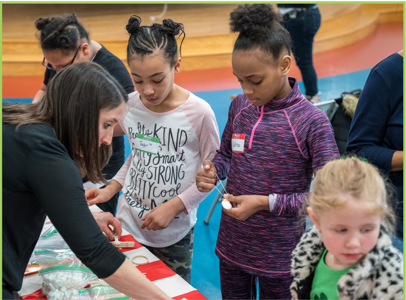
Children working on projects at the Young Women in STEM Fair at the Bowie Branch.

With the adoption of this plan in 2020, PGCMLS embraces a path forward that positions the Library as an essential catalyst for community advancement. Library staff, Board of Library Trustees, and community members will expand their capacity as influencers and storytellers. The Library will strengthen the public's trust by being relevant and impactful in the daily life of the community. In the first year of implementation, the staff working group and Board of Library Trustees will partner to establish performance measures that will be used to engage the wider community to reflect on the progress of the strategic framework, which is a living and dynamic document. Ultimately, this work represents the commitment of the Board and staff to demonstrate how vital and powerful PGCMLS can be in the advancement of Prince George's County.