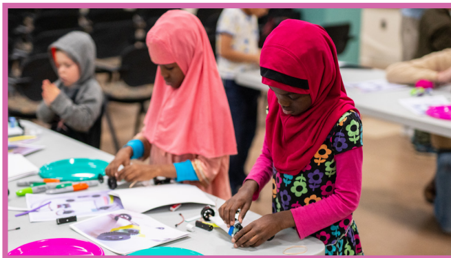
Children creating electric vehicles at a FutureMakers program at the Greenbelt Branch.