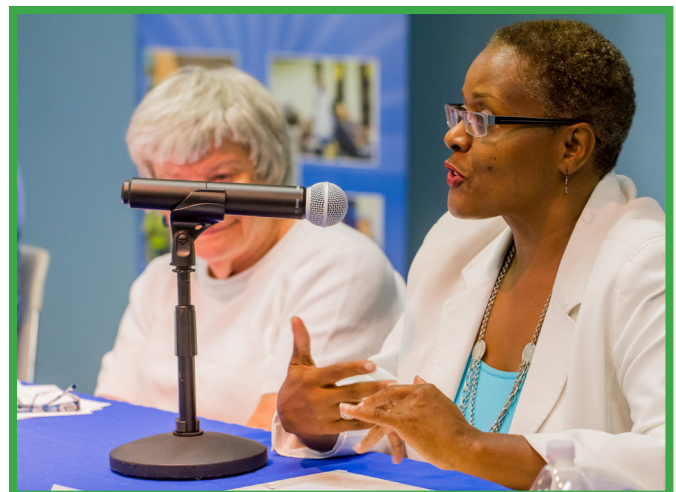
The Career Change Panel Discussion at the Hyattsville Branch.