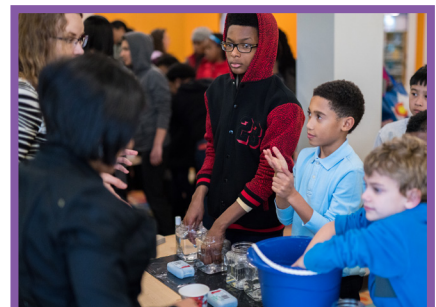
BrainSTEM: Neuroscience in the Afternoon at the Bowie Branch.