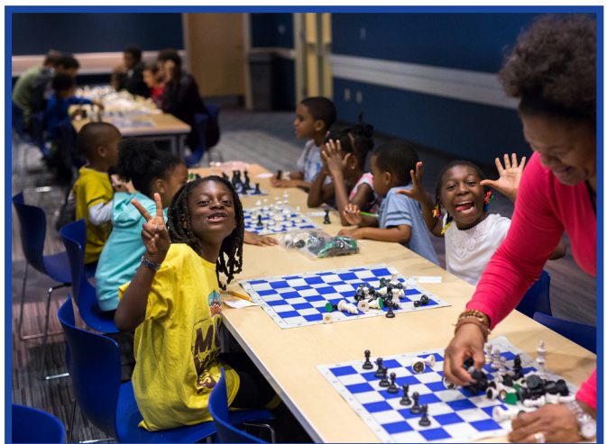
Having fun at Chess For Kids at the South Bowie Branch.