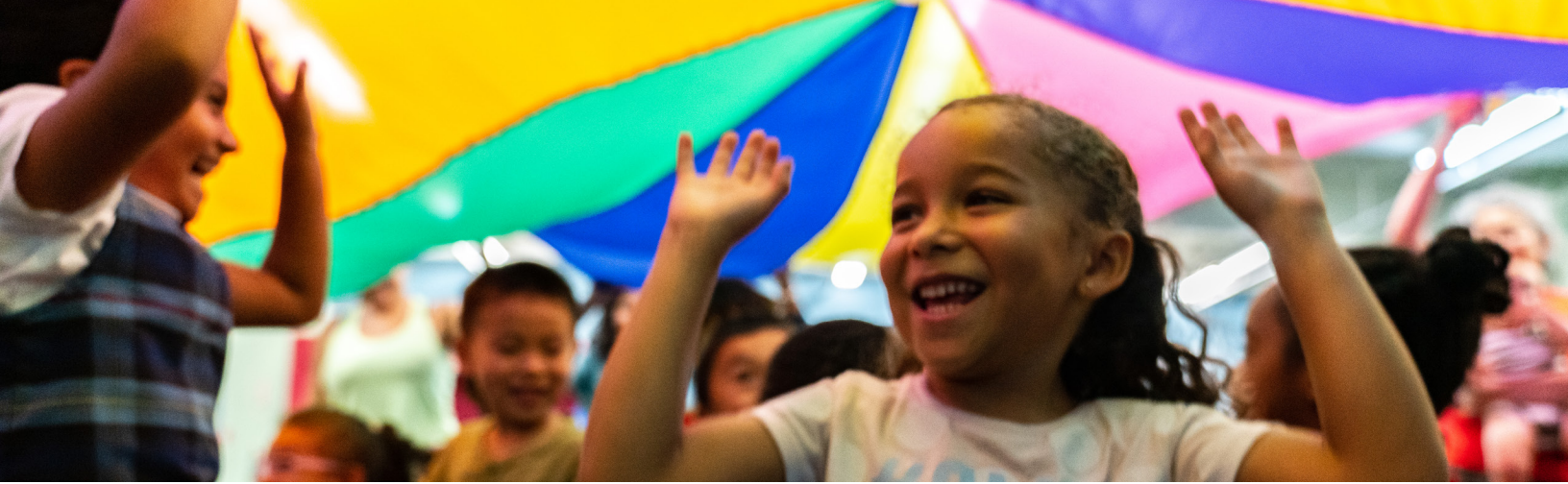
1,2,3 Andres event at the Beltsville Branch.

PGCMLS will approach its new mission by looking outward and developing a renewed understanding of community needs through more robust engagement with the County, customers, and partners. Staff will continue to enrich their skill sets to adeptly approach complex issues with compassion, creativity, and integrity. It is not enough to be a passive provider of information. It is critical that PGCMLS embraces its role as developer, convener, and facilitator of vibrant community life.