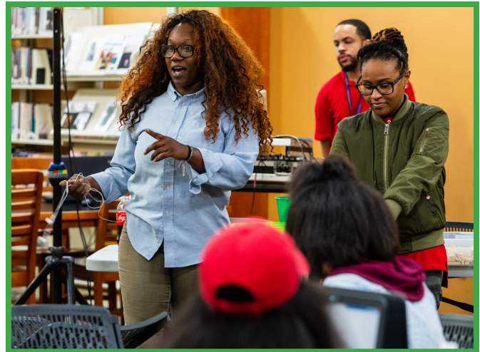
Teens learning from the Hip-hop Architecture Camp at the Oxon Hill Branch.