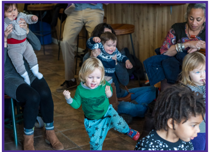
Children dancing at Ready 2 Read Storytime at The Waterhole in Mount Rainier.