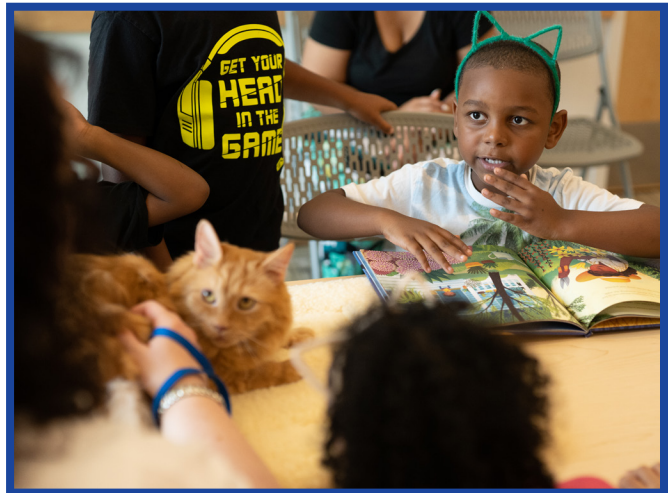
Cat Adoption Fair at the Laurel Branch.

The Aspen Institute's "Rising to the Challenge: Re-Envisioning Public Libraries" report states that the 21st century public library experience can occur anywhere libraries create community through the deployment of their brand, values, services, and assets. The Aspen report findings, which are reflected in the new PGCMLS mission and the Carnegie model of American public libraries, challenges bold and aspirational libraries to lead by creating conditions for communities to flourish. PGCMLS embraces this call to action by leveraging existing community networks to align strategic areas of focus with countywide initiatives established by civic leaders.