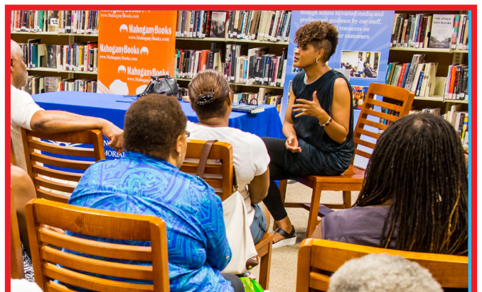
Meet the Author event with Dolen Perkins-Valdez at the Oxon Hill Branch.