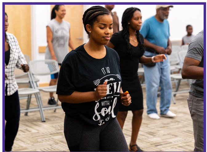
Library customers getting active at a fitness event.