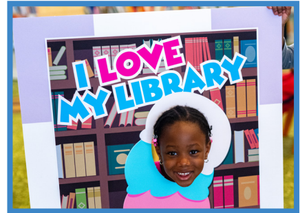
Loving the library at the Rockin' to Rhythm event at the Laurel Branch.