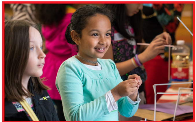
Young Women in STEM Fair at the Bowie Branch.