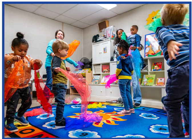
Ready 2 Read Story Time at the Baden Branch.

Public libraries are a gift to the community, a place where graciousness, compassion, and affirmation inform every opportunity to engage as individuals or as a group. This strategic framework articulates the community's preferred future for PGCMLS. It offers an outcome-driven illustration of how PGCMLS will serve residents no matter their stage of life, interests,