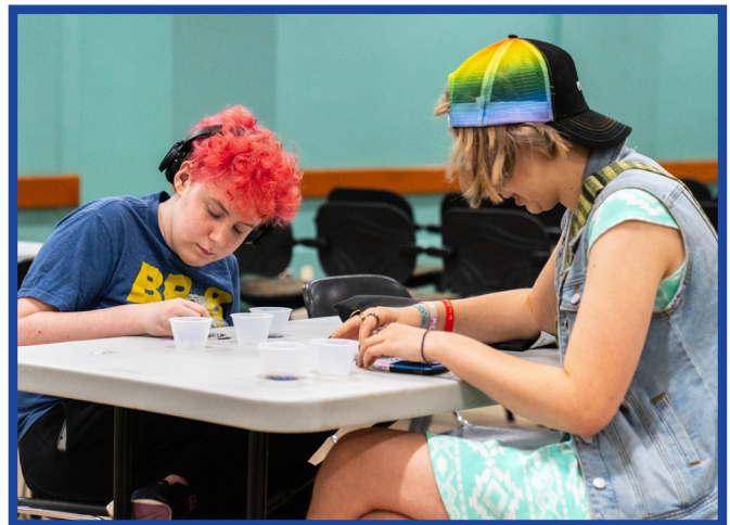
Teens attending "Show Your Pride" and creating artwork at the Greenbelt Branch.