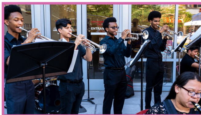
Teens performing at the Libraries Rock! Block Party at the Hyattsville Branch.