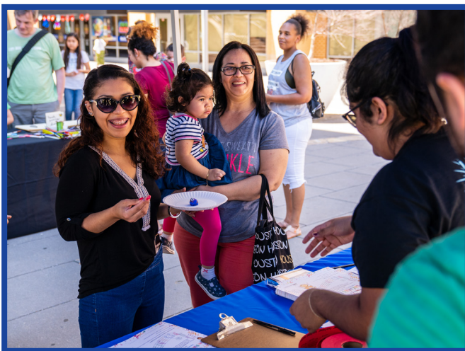
Libraries Rock! Block Party at the Hyattsville Branch.

PGCMLS and county agencies will strengthen collaborations to celebrate the distinct character of the County and the many different local communities that make the area one of the most diverse in the country. The Library's role is to provide individuals with opportunities opportunities for learning and discovery that foster personal, economic, and community growth.