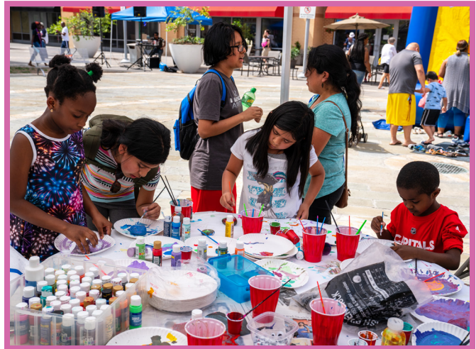
Children painting at the Libraries Rock! Block Party at the Hyattsville Branch.