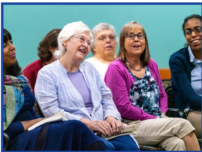
Book discussion at the Greenbelt Branch.

"Whether you are a child learning how to read, a job-seeker, an artist, or a retiree, PGCMLS is here to support your curiosities, aspirations, and imagination."