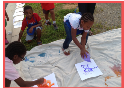
Art activity at the South Bowie Branch.