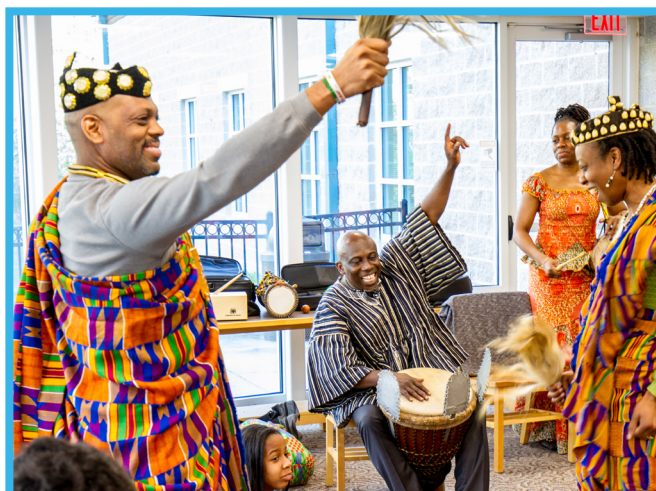
Ananseghromma of Ghana at the Accokeek Branch celebrating Black History Month.