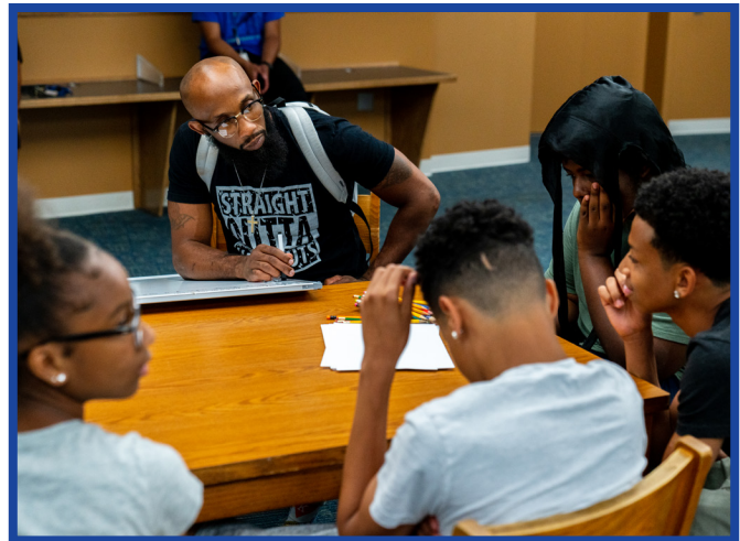
Brainstorming at the D.R.E.A.M. Lab Production Camp at the Fairmount Heights Branch.

The Library and its customers can co-lead the County to a brighter future by deepening relationships through openness and creating conditions for all in the community to flourish.