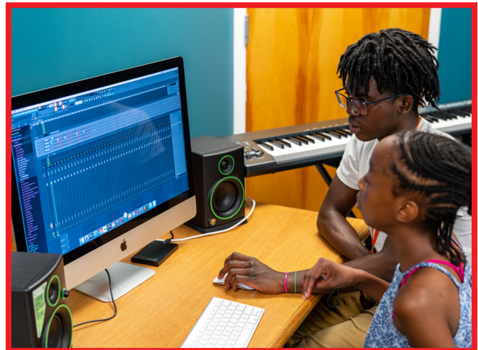
Teens using technology to produce music at the D.R.E.A.M. Lab Production Camp at the Fairmount Heights Branch.